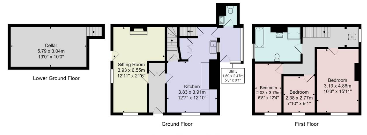
Total Area: 129.1 m² ... 1389 ft² All measurements are approximate and for display purposes only. No liability is accepted by either the agency or Box Property Solutions Ltd as to the exact measurements of the rooms. Box Property Solutions Ltd retains the copyright on this plan and allows agents to use it with agreed permission.