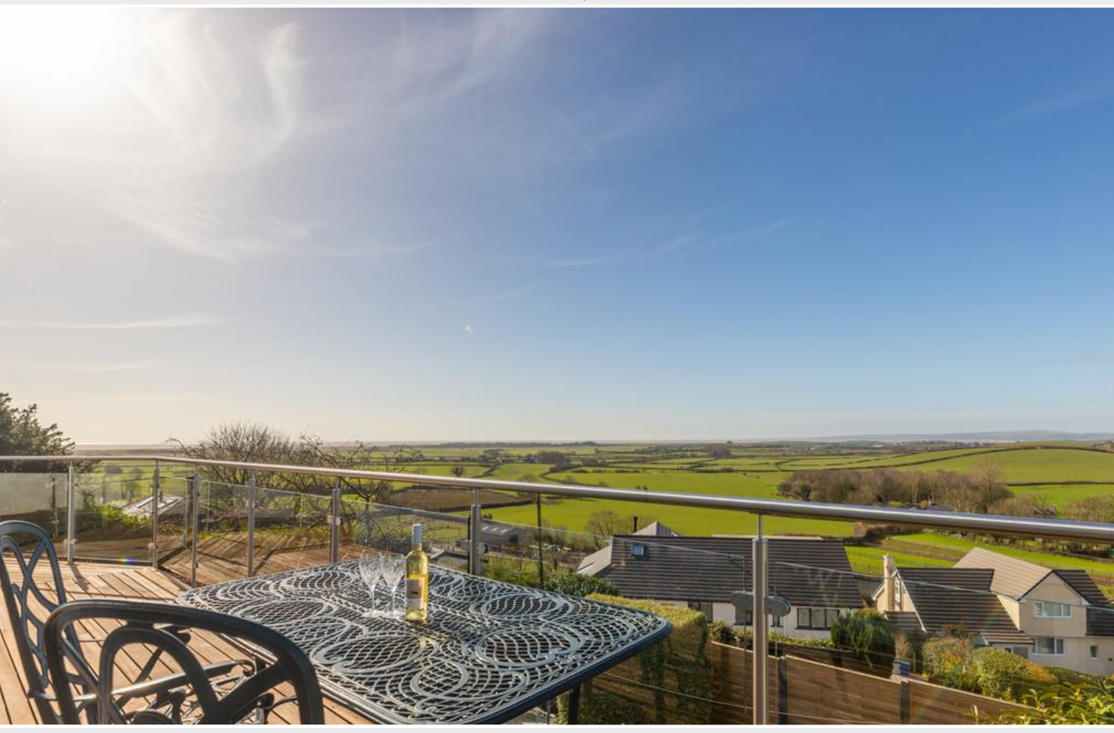
Balcony and Views