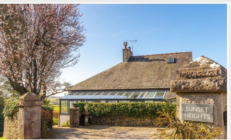
Rear Elevation and Parking