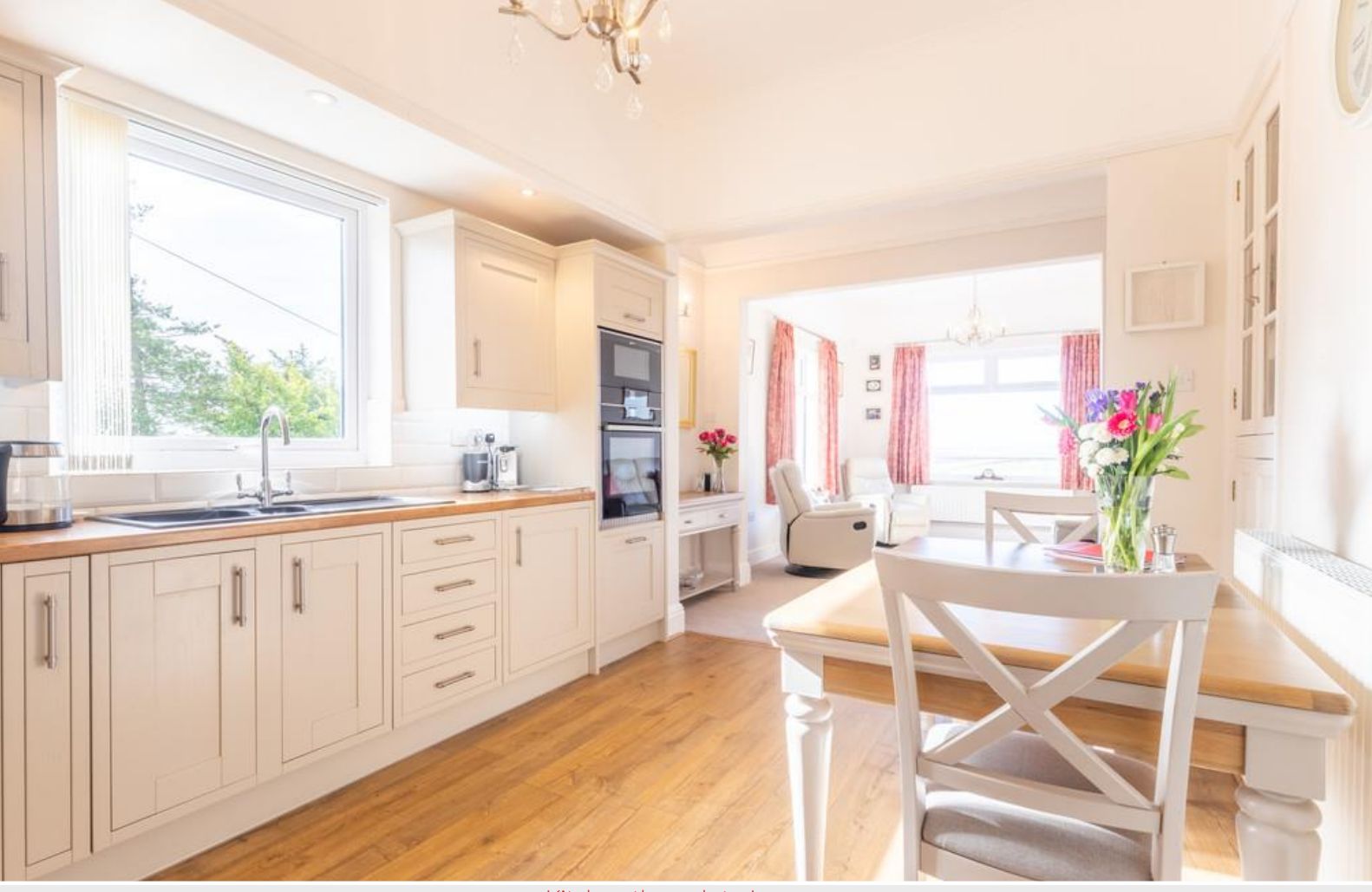
Kitchen through to Lounge