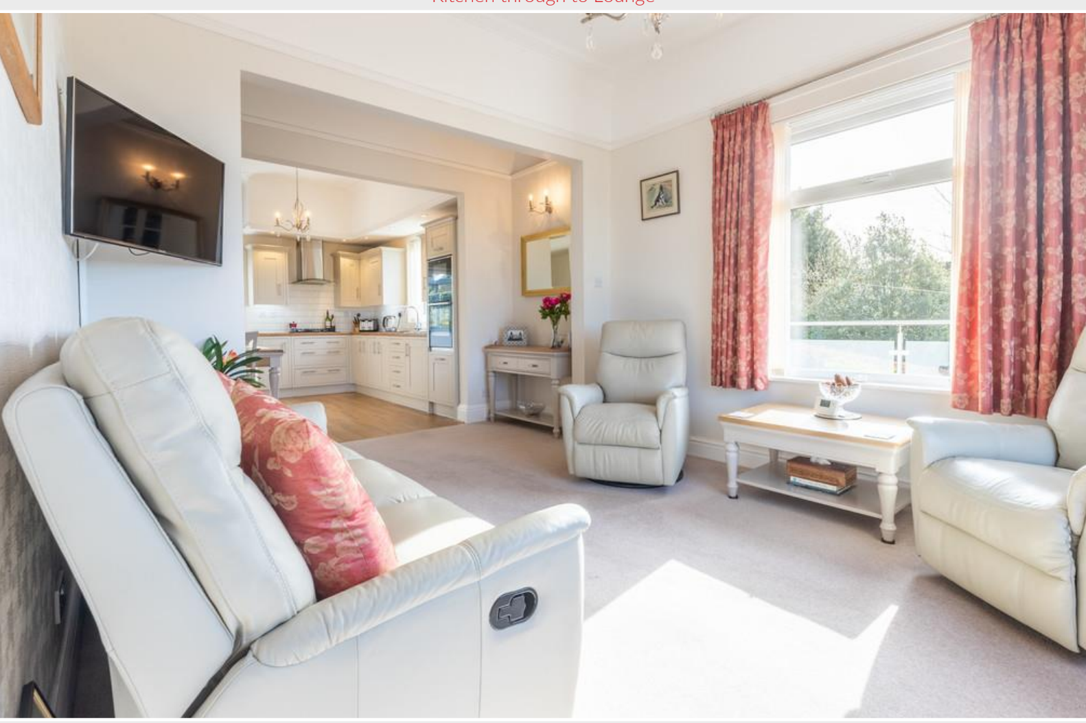
Lounge through to Kitchen