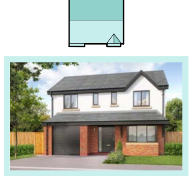
The Reedley 4 bedroom detached house with integralsingle garage Plots 6, 9, 18, 36, 51, 56, 71 & 74