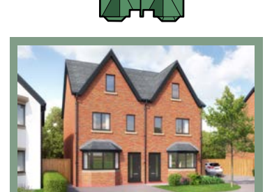
The Rishton 3 bedroom semi detached house with parking spaces Plots 78, 79, 80 & 81

Plots 3, 4, 25, 26, 35, 37, 42, 44, 49, 54, 55, 57, 62, 67, 68, 75 & 85