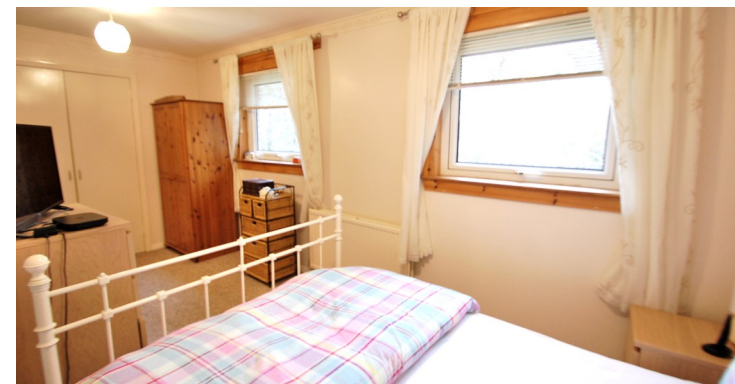
72 Falcon Brae