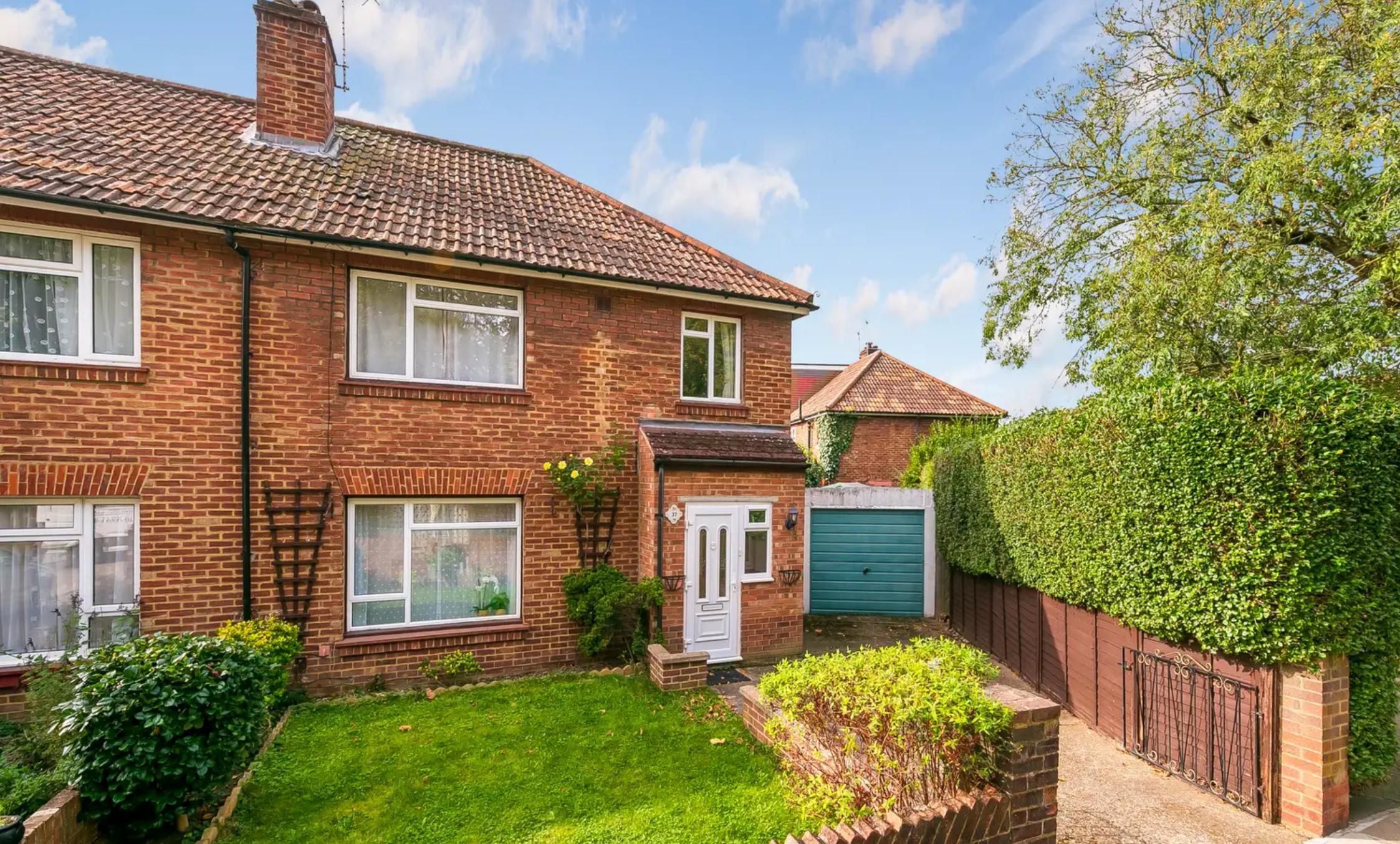
37 Craig Road, Richmond £2,800 pcm