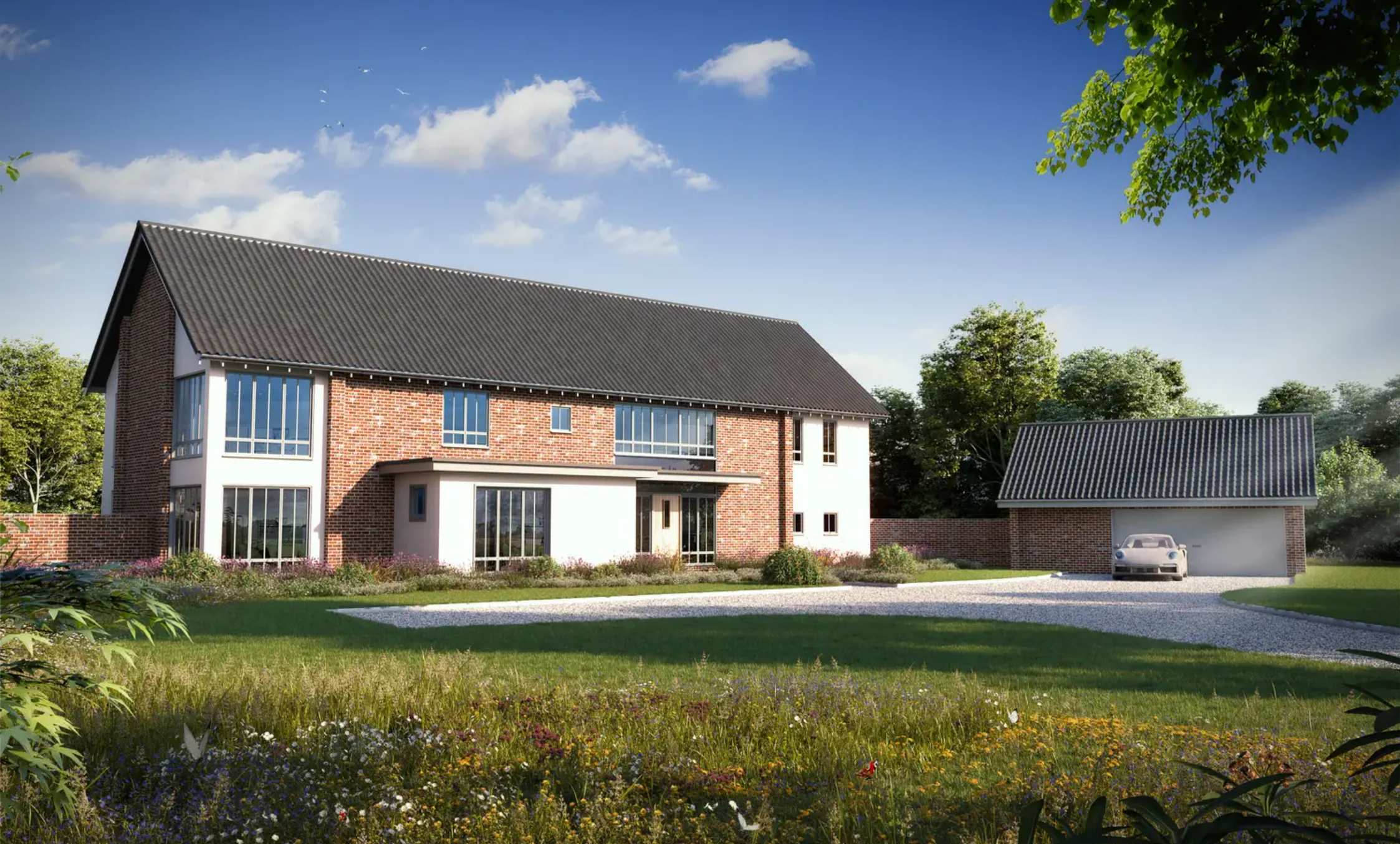
Poplar House Silfield Street, Silfield £1,000,000