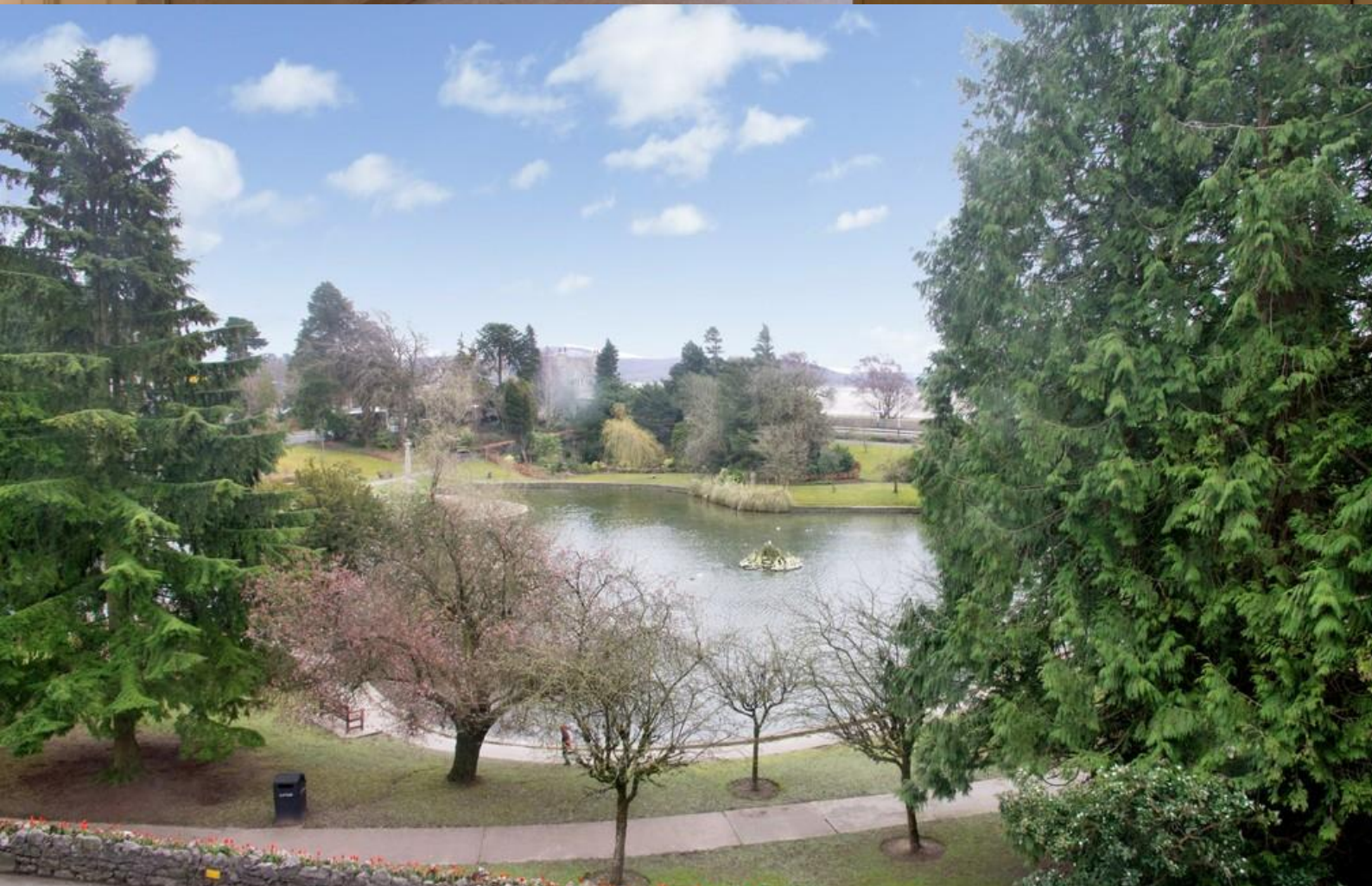
View from Lounge & Bedrooms 1 & 3