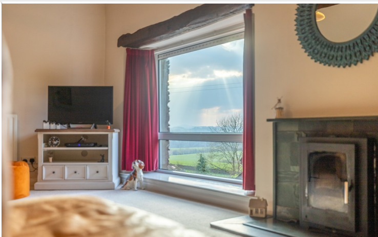
Living Room with a View

Location: The property forms part of the attractive rural hamlet of Garth Row which is about two miles north of the market town of Kendal, just off the A6 Shap Road. Garth Row is surrounded by glorious countryside and is close to the beautiful valley of Longsleddale, which is within the Lake District National Park. There is a highly regarded primary school at nearby Selside and the historic market town of Kendal provides an excellent range of amenities.