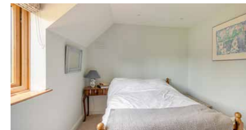
On the first floor, the airy principal bedroom benefits from handmade fitted wardrobes made by Churchill Brothers. Fitted wardrobes by this company can be found in all the bedrooms. The principal bedroom also has a sleek en suite shower room with walk in shower and a chrome towel heater. The second and third bedrooms are good sized doubles with fitted wardrobes and lovely views over the countryside. The three piece family bathroom has a bath and is the ideal size for any family configuration.