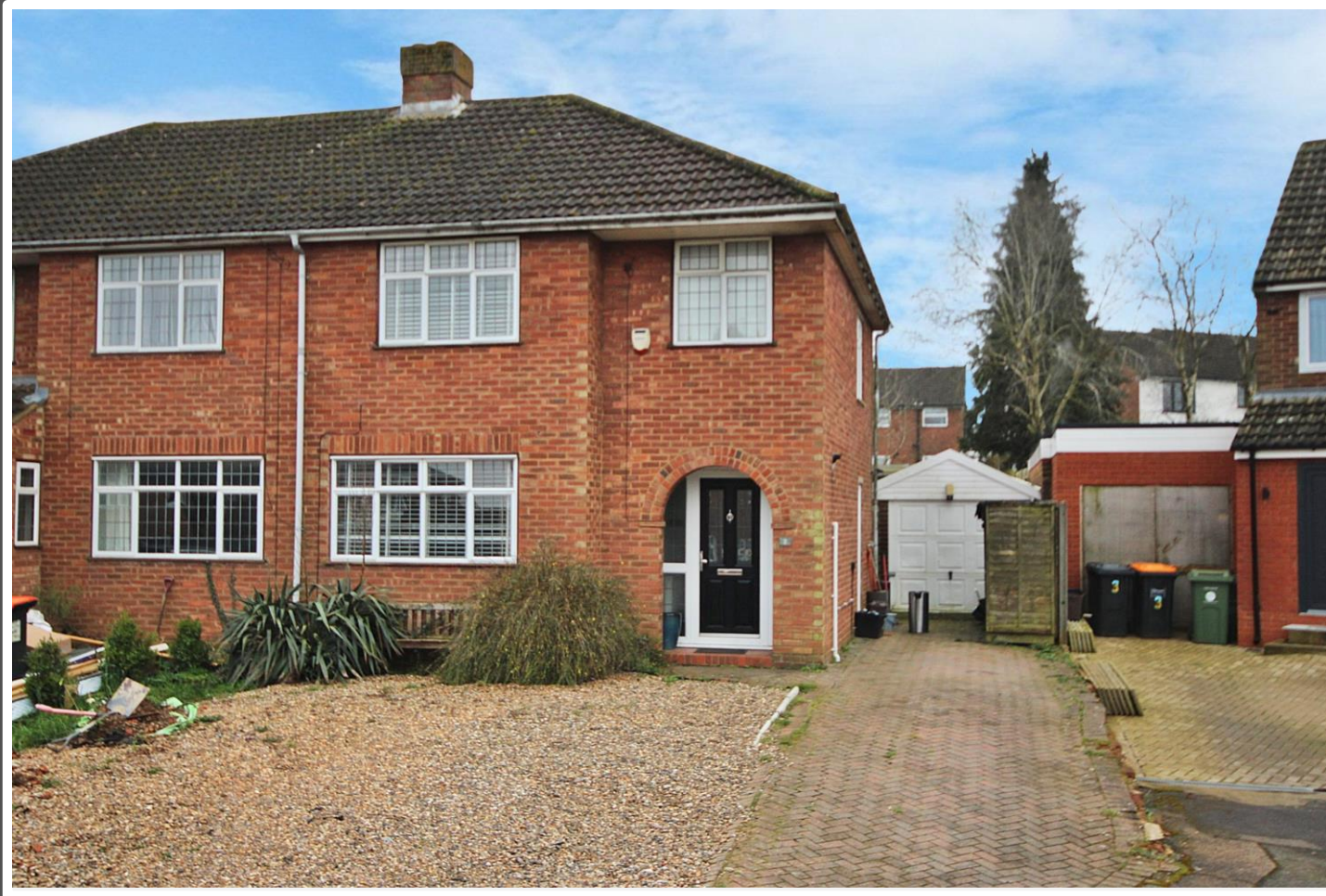
Herne Close, Toddington, Bedfordshire, LU5 6AF