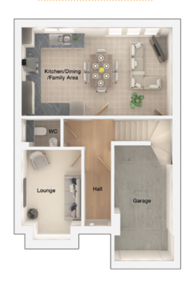
Kitchen/Dining/Family Area 20'6" x 12'1" Lounge 8'1" x 12'3" WC 5'3" x 3'10" Garage 7'11" x 15'10"