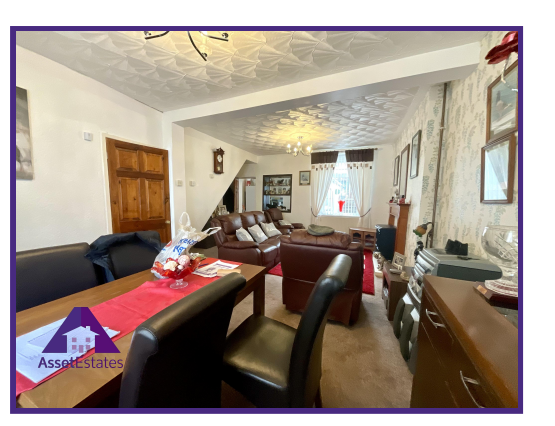
Gray Street, Abertillery, NP13 1EN