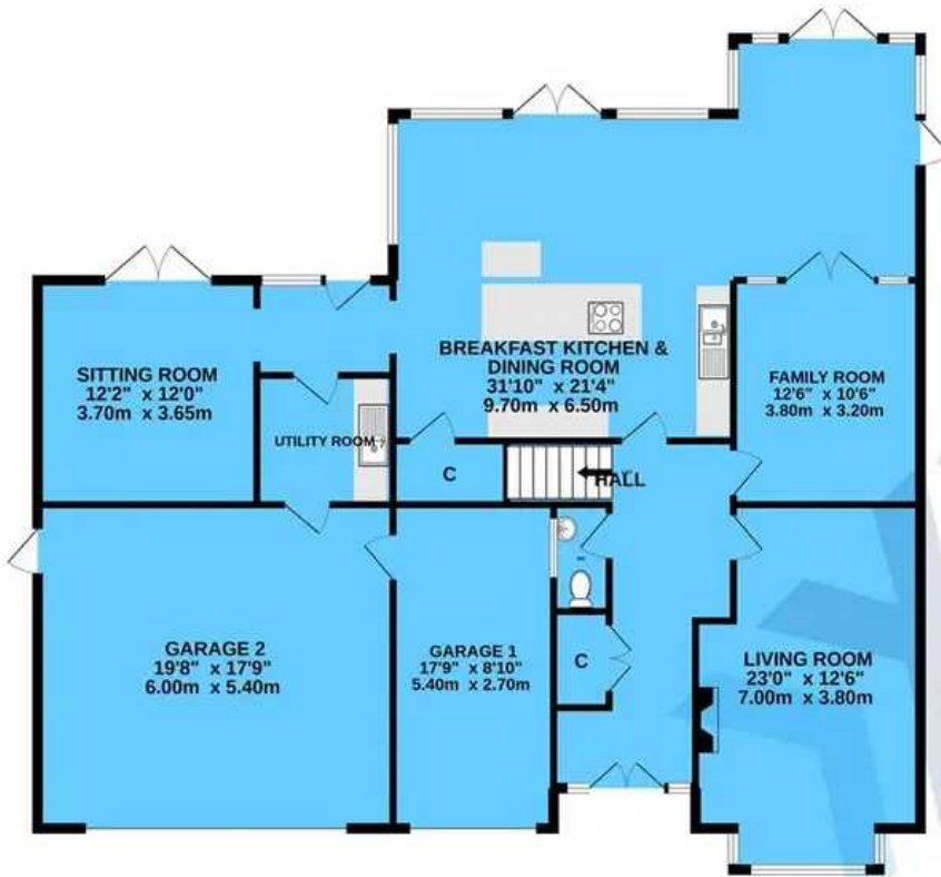
GROUND FLOOR 1831 sq.ft. (170.1 sq.m.) approx.