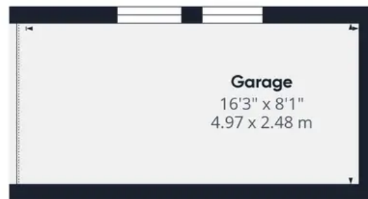
Floor 1 Building 2