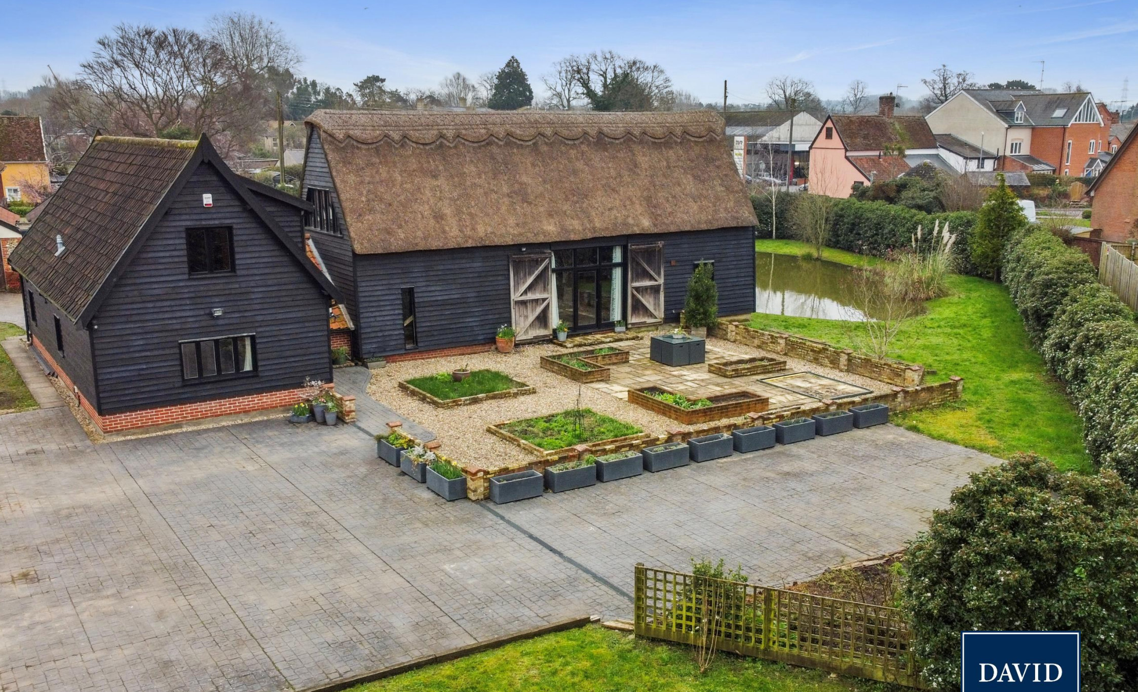
Lake Barn, 27 School Street Needham Market, Suffolk