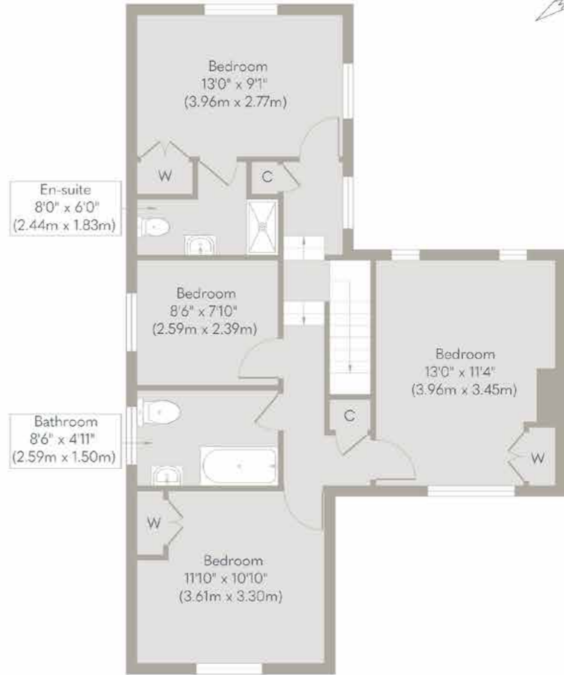
First Floor Approximate Floor Area 707 sq. ft (65.68 sq. m)