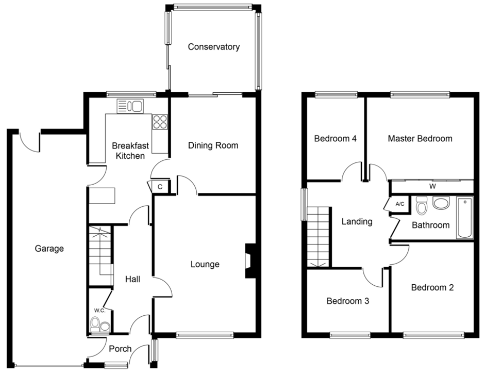
Ground Floor First Floor Approx. Gross Internal Floor Area 1,515 sq.ft. (140.8 sq.m.)

Whilst every attempt has been made to ensure the accuracy of the floor plan contained here, measurements of doors, windows, rooms and any other items are approximate and no responsibility is taken for any error, omission, or mis-statement. The measurements should not be relied upon for valuation, transaction and/or funding purposes. This plan is for illustrative purposes only and should be used as such by any prospective purchaser or tenant. The services, systems and appliances shown have not been tested and no guarantee as to their operability or efficiency can be given. Copyright V360 Ltd 2024 | www.houseviz.com