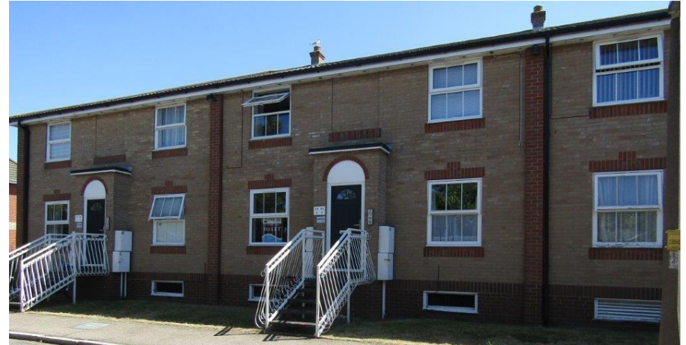
Stour View Court Stour Road, Harwich

Agents Note: Whilst every care has been taken to prepare these particulars, they are for guidance purposes only. All measurements are approximate, are for general guidance purposes only and whilst every care has been taken to ensure their accuracy they should not be relied upon and potential tenant: are advised to recheck the measurements.