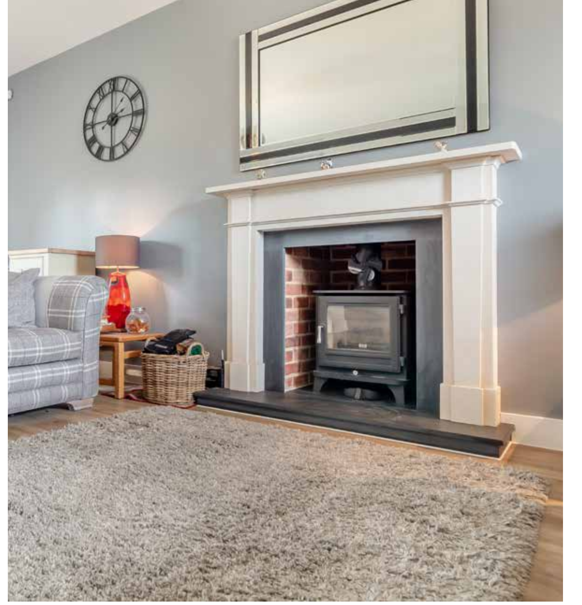
"The stunning dual aspect lounge with bi-fold doors opening out onto the garden..."