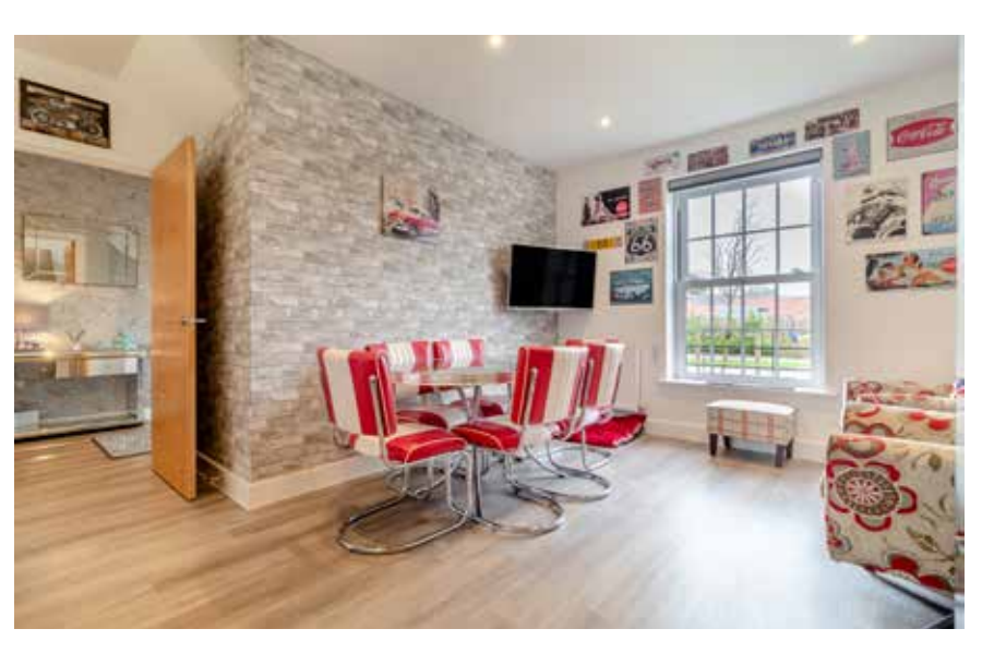
A Stunning Contemporary Space