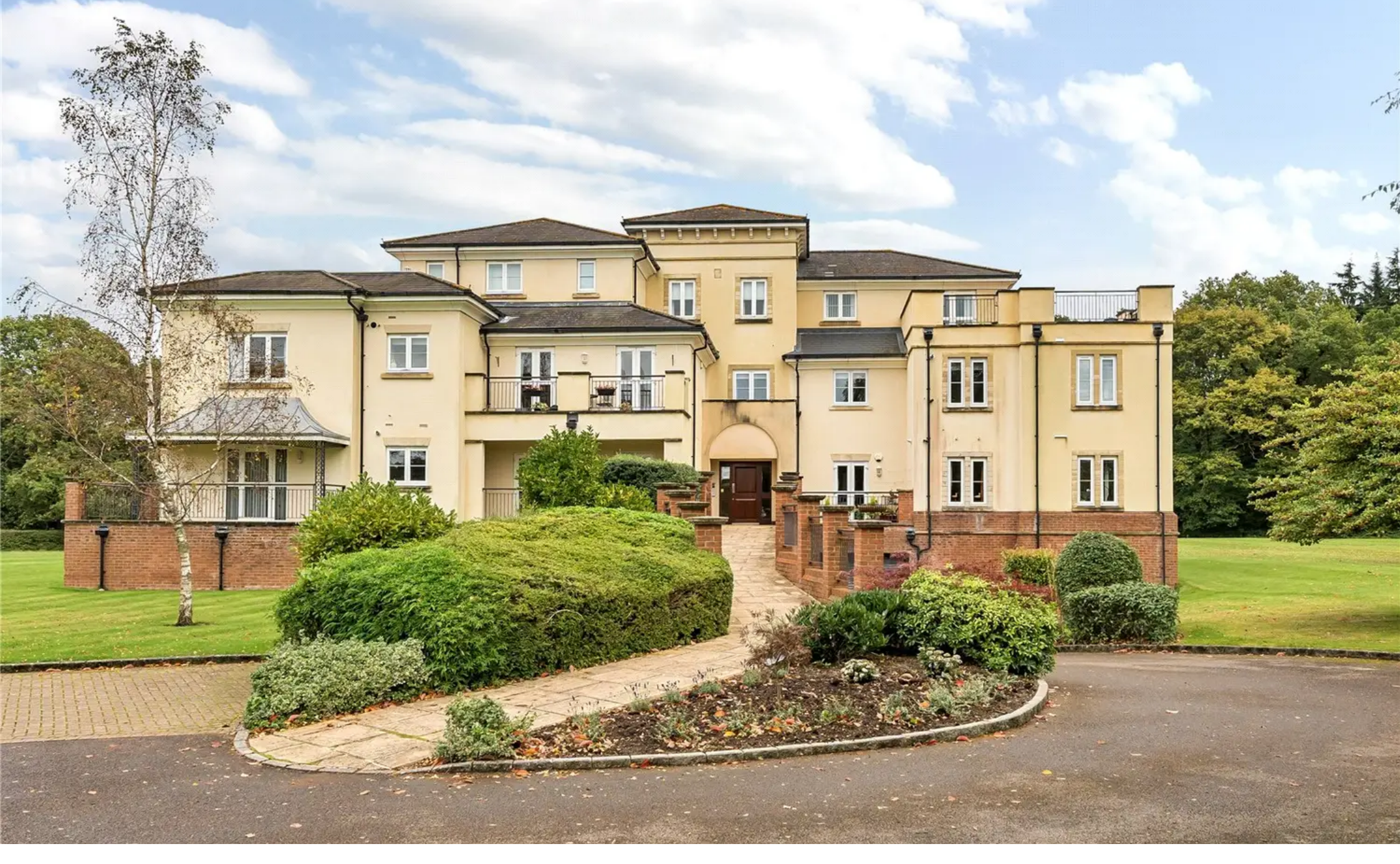
Flat 8, Sycamore House, 10 East Parkside - CR6 9QT Guide Price £577,500