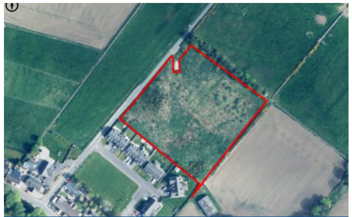
PLAN PREPARED FOR ILLUSTRATIVE PURPOSES AND GUIDANCE ONLY. NOT TO SCALE.

Note: Prospective purchasers should note that unless their interest is formally intimated to the selling agents following inspection, the agents cannot guarantee that notice of a closing date for offers will be advised and consequently the property may be sold without notice.