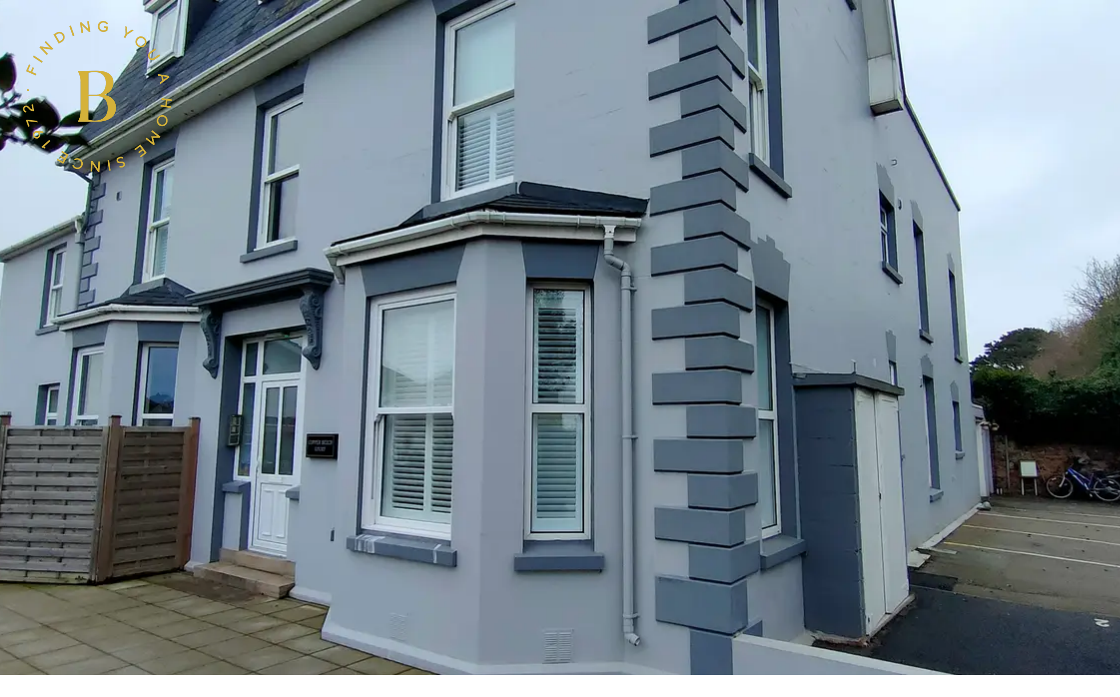
Flat 5 Copper Beech, La Grande Route de St Jean, St Helier