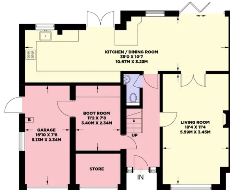
Ground Floor 893 sq Ft / 83.0 sq M (INCLUDING GARAGE / EXCLUDING STORE)