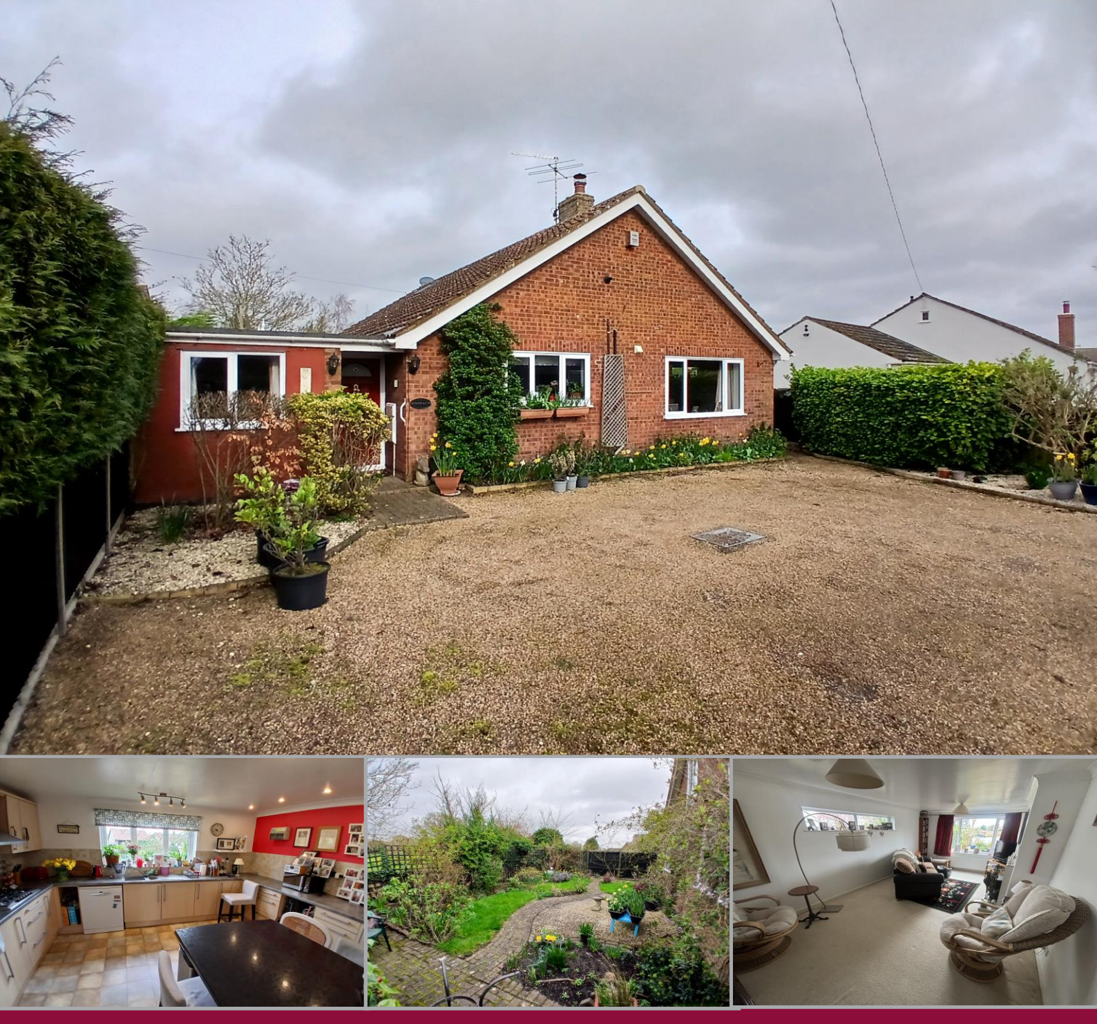
Flambards | Hadleigh Road | Elmsett | IP7 6ND

Specialist marketing for | Barns | Cottages | Period Properties | Executive Homes | Town Houses | Village Homes