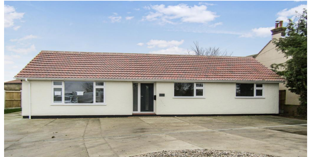
Pork Lane Great Holland, Frinton-on-Sea

Not to Scale. Produced by The Plan Portal 2024 For Illustrative Purposes Only.