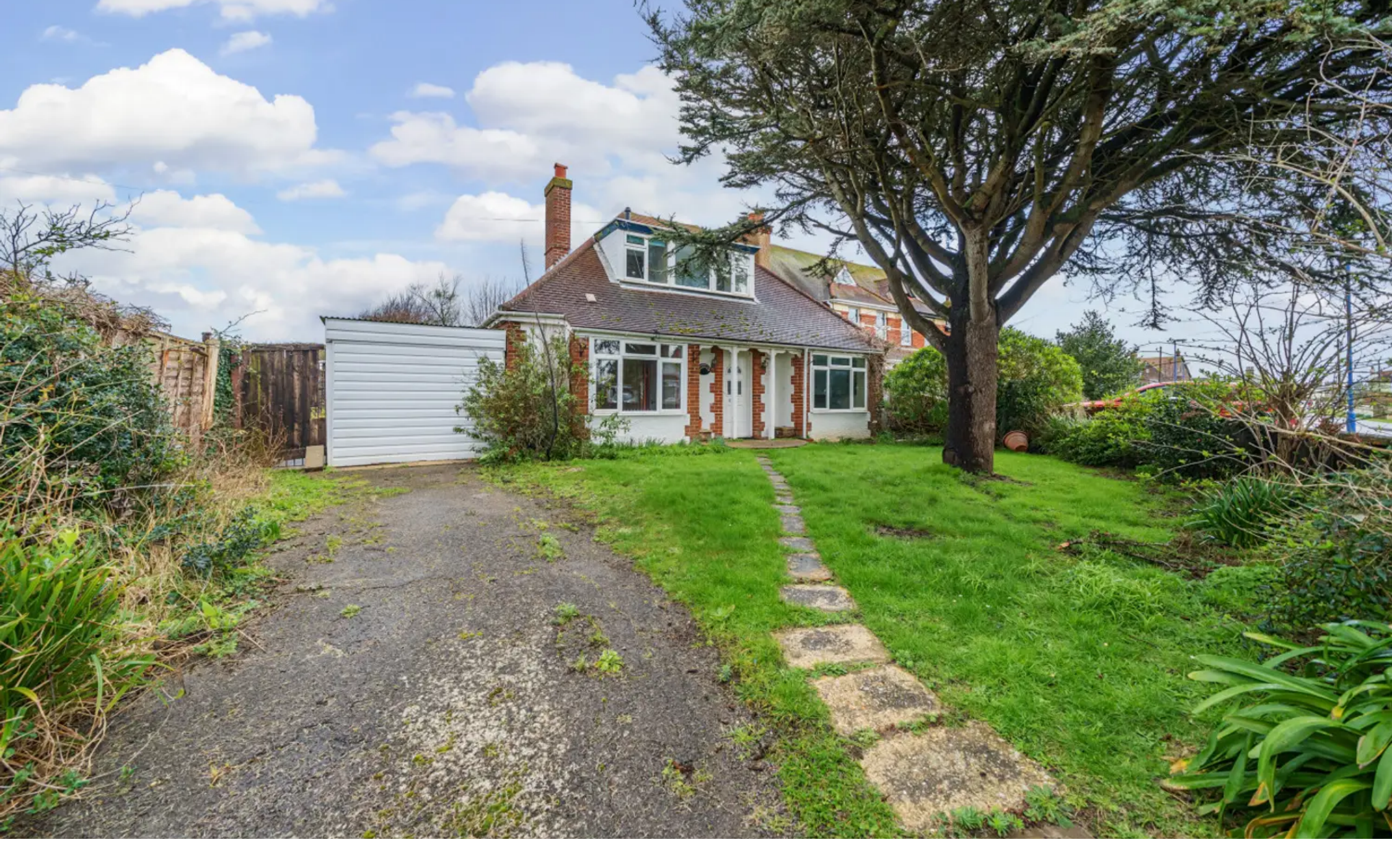
20 Grafton Road, Selsey Guide Price £460,000 Freehold