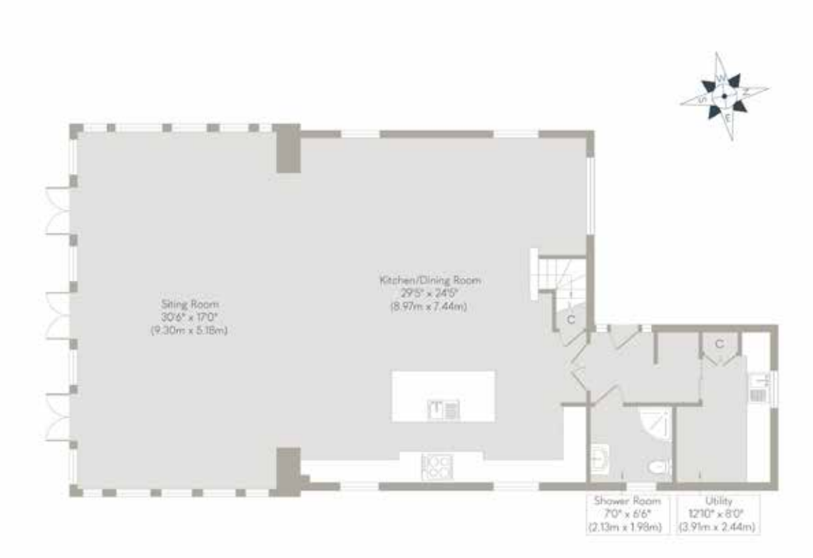
Ground Floor Approximate Floor Area 1497 sq. ft (139,04 sq. m)