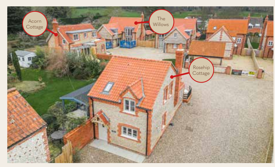
Three beautiful, individual homes available at The Quavers.