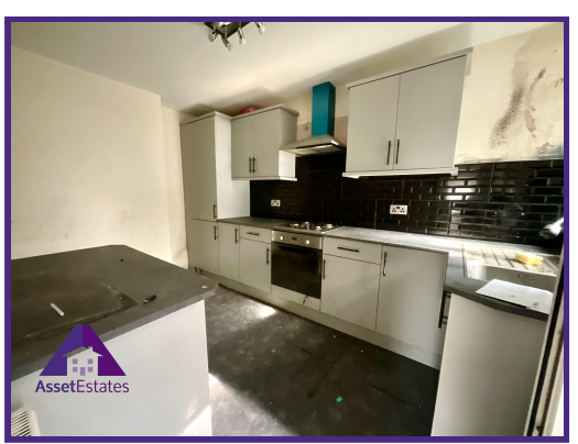
Blaencuffin Road, Llanhilleth, Abertillery, NP13 2RW