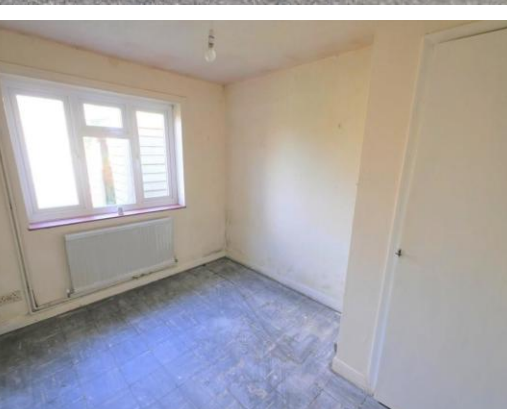
The Green | Pettaugh | IP14 6DH