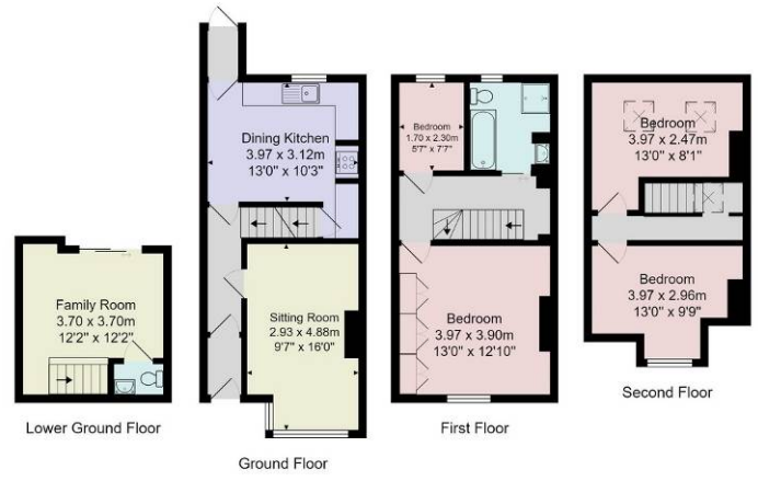
Total Area: 108.8 m² ... 1171 ft² All measurements are approximate and for display purposes only. No liability is accepted by either the agency of Box Property Solutions £td as to the exact measurements of the rooms. Box Property Solutions £td retains the copyright on this plan and allows agents to use it with agreed permission.