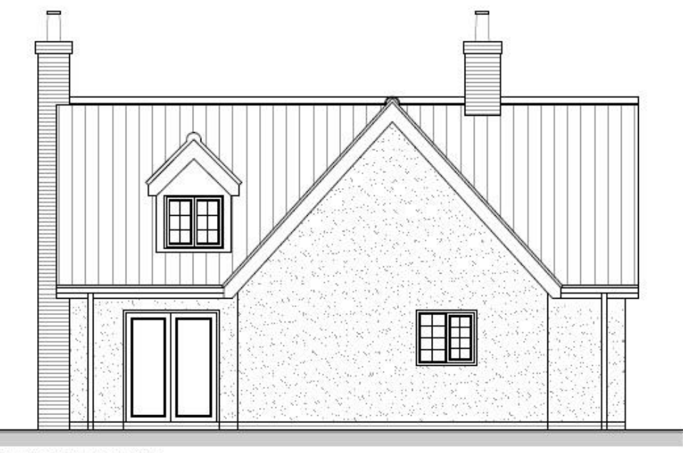
REAR / SOUTH ELEVATION