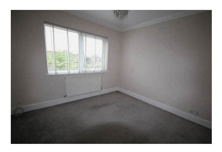
BEDROOM 2 10' 8" x 10' (3.25m x 3.05m) Radiator and double glazed window.