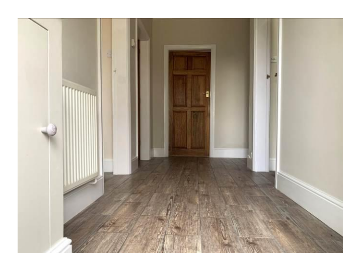
LOUNGE: 11' 6" x 11' 2" (3.51m x 3.4m) Radiator and double glazed window.

ENTRANCE HALL: Radiator and tiled floor.