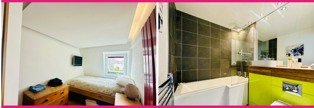
THIRD FLOOR 566 sq.ft. (52.6 sq.m.) approx.