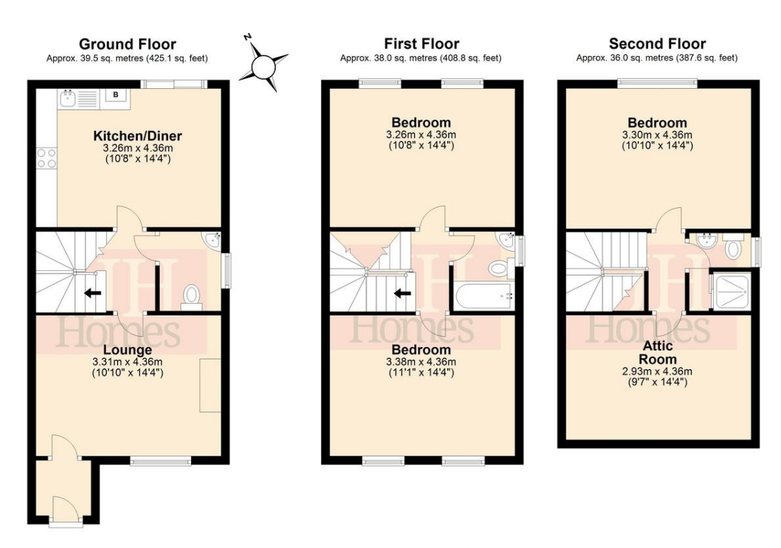
Total area: approx. 113.5 sq. metres (1221.5 sq. feet)