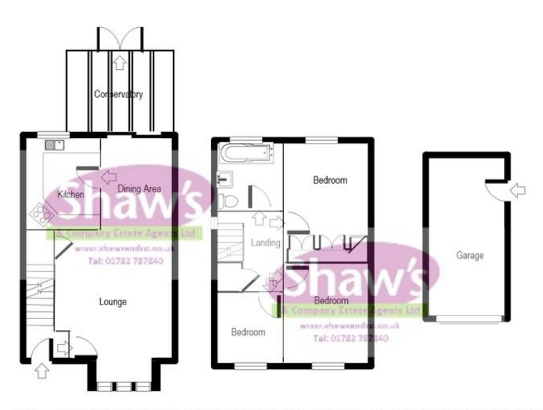
Whilst every attempt has been made to ensure the accuracy of the floor plan contained here, measurements of doors, windows, nooms and any other items are approximate and no responsibility is taken for any error, omission, or mis-statement and the floor plan is an illustration only as a guide. This plan is for illustrative purposes only and should be used as such by any prospective purchasted retenant. The services, systems, appliances, shown have not been tested and no guarantee as to their operation or efficiency can be given. Made with 1'sual Builder