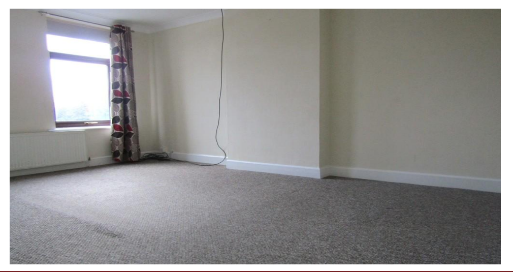
Rent: £850 pcm Energy Efficiency Rating D