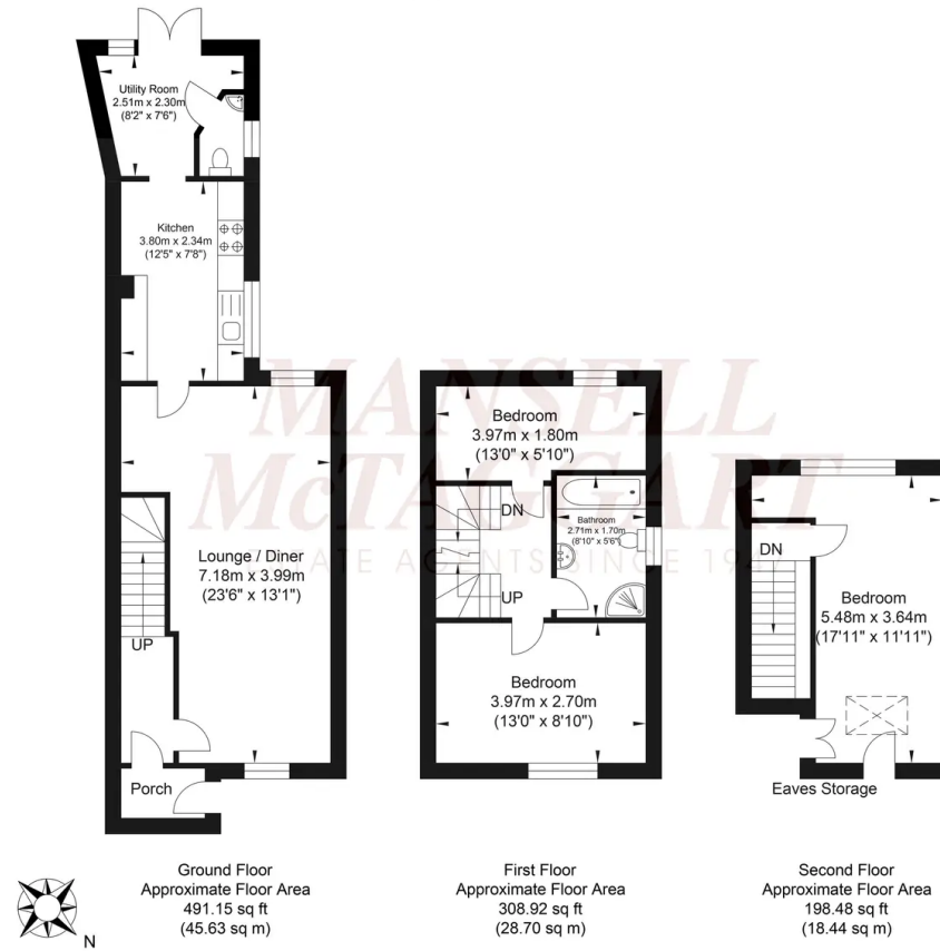
Ground Floor Approximate Floor Area 491.15 sq ft (45.63 sq m) First Floor Approximate Floor Area 308.92 sq ft (28.70 sq m) Second Floor Approximate Floor Area 198.48 sq ft (18.44 sq m)

Approximate Gross Internal Area = 92.77 sq m / 998.56 sq ft Illustration for identification purposes only, measurements are approximate, not to scale.