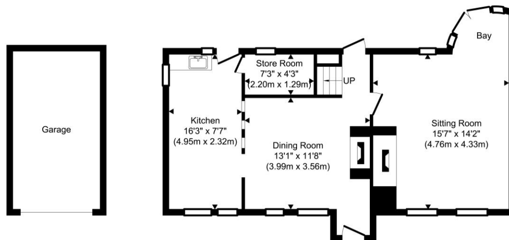
Ground Floor Approximate Floor Area 608.48 sq. ft. (56.53 sq. m)

TOTAL APPROX. FLOOR AREA 1185.96 SQ.FT. (110.18 SQ.M.)