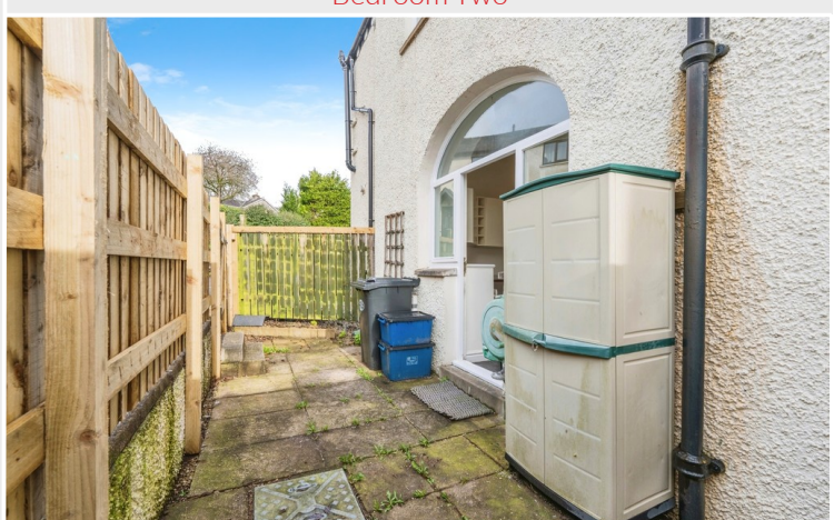
Enclosed private patio