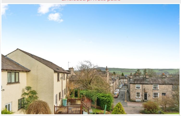
Views across to Benson Knott