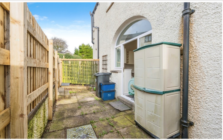
Enclosed private patio