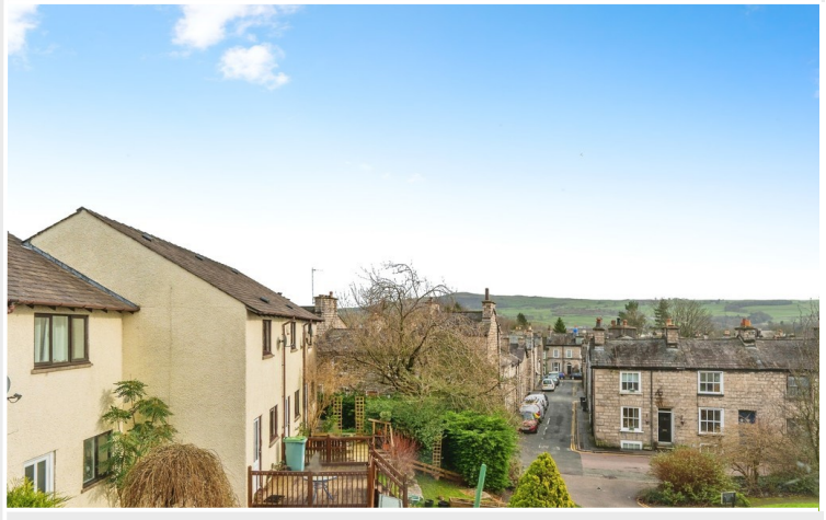
Views across to Benson Knott