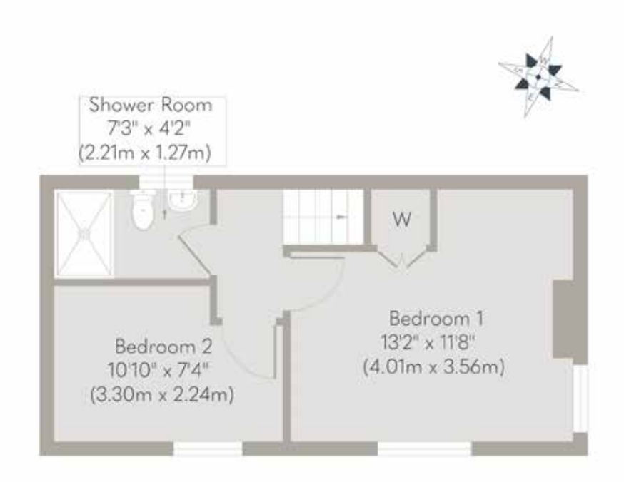
First Floor Approximate Floor Area 284 sq. ft (26.38 sq. m)