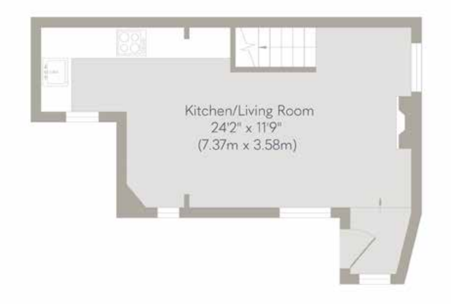
Ground Floor Approximate Floor Area 264 sq. ft (24.52 sq. m)

Whilst every attempt has been made to ensure the accuracy of the floor plan contained here, measurements of doors, windows, rooms and any other items are approximate and no responsibility is taken for any error, omission, or mis-statement. This plan is for illustrative purposes only and should be used as such by any prospective purchaser or tenant. The services, systems and appliances shown have not been tested and no guarantee as to their operability or efficiency can be given. Copyright V360 Ltd 2023 | www.houseviz.com