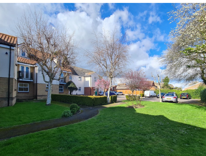
To view this property call Curtis O' Boyle Estate Agents on 01621\ 855558