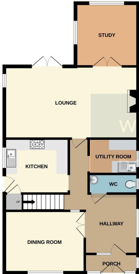
GROUND FLOOR 814 sq.ft. (75.6 sq.m.) approx.