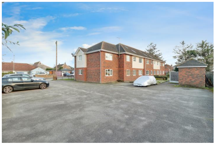
Agent's Note: Lease length - 107 years. Ground rent - £250 per annum. Service charge - £1,200 per annum.

Skimmed ceiling. Three piece suite comprising close coupled w/c, hand wash basin with storage beneath and panelled bath with mixer shower. Chrome heated towel rail. Tiled walls. Tiled floor.