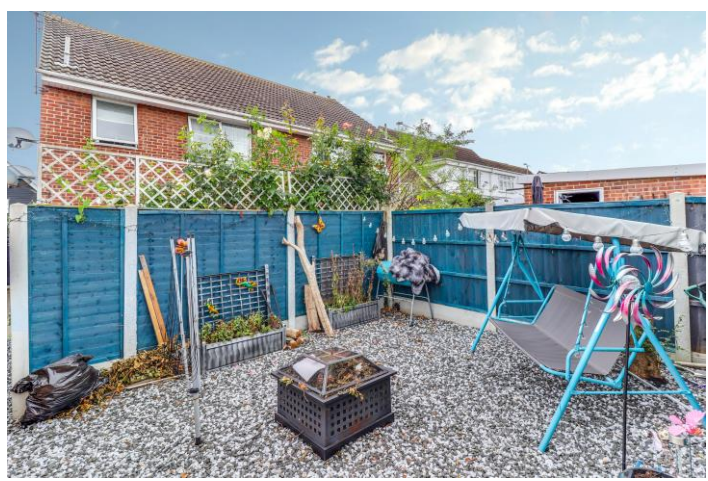
GARAGE in nearby block with up and over door.