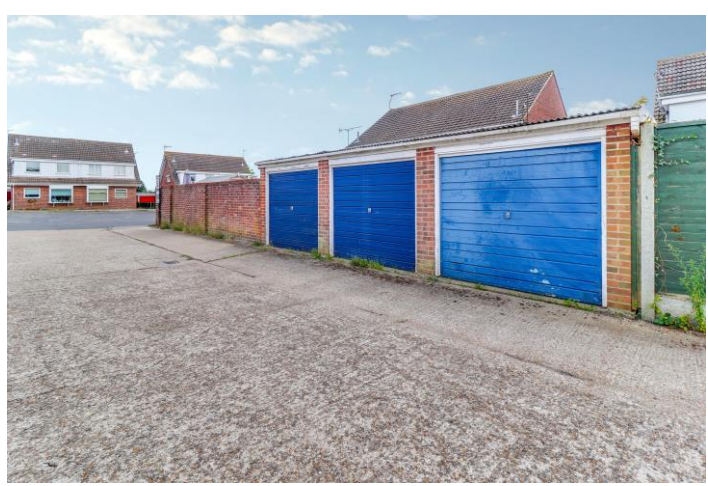
Agent's Note: Lease length - 167 years. Ground rent - £150 per annum. No service charges.