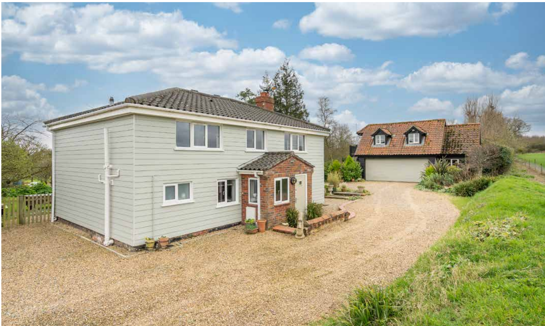
Mill House Mill Hill | Mettingham | Suffolk | NR35 1TR