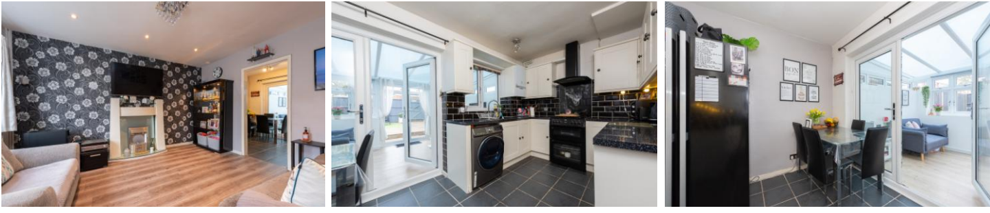
Kingsway Camberley, GU17 oJW £360,000