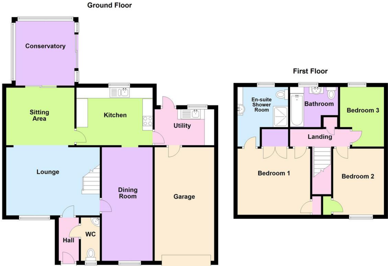
Floor plans are to show layout only and are not drawn to scale.

MONEY LAUNDERING REGULATIONS: Under the Money Laundering Rules 2007, The Proceeds of Crime Act 2002 and The Terrorism Act 2000 the Agent is legally obliged to verify the identity of the Client through sight of legally recognised photographic identification (e.g. passport, photographic drivers licence) and documentary proof of address