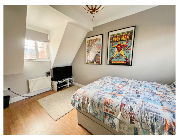
BEDROOM FOUR 13' max x 11' 4" (3.96m x 3.45m)

Double glazed window to front and rear aspects. Built in storage cupboard. Radiator. Coving to plastered ceiling. Wood effect flooring.