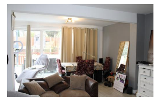
Dovedale Avenue, Clayhall, Essex, IG5 0QF